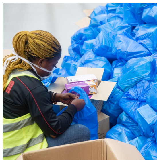
Ministry of Health staff receive and prepare personal protective equipment commodities for distribution to remote communities across Liberia.

Comfort is overseeing infection prevention and control for the COVID-19 response. In June 2020, Comfort reflected on the upcoming facilitation of a Training of Trainers in Montserrado County, where the majority of cases had been identified.