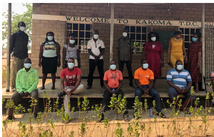
Community health workers in Chikwawa District, Malawi attend a training on the COVID-19 Operational Guide.

In Malawi's Chikwawa District, Last Mile Health trained 284 community health workers and their supervisors on the country's COVID-19 Operational Guide, which includes a module on case identification so that community members suspected of having COVID-19 can be isolated as early as possible. Last Mile Health incorporated updated training modules on contact tracing and home-based care guidelines to ensure the training provided remains up-to-date.