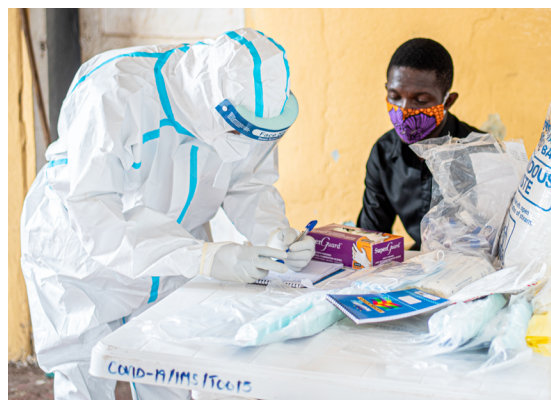
A clinician prepares a COVID-19 sample at a Ministry of Health enhanced surveillance site in Monrovia, Liberia.